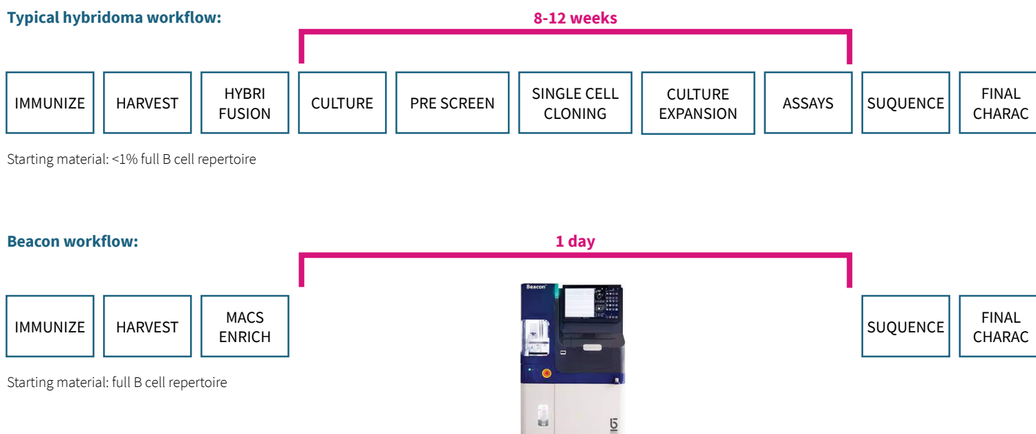
Figure 1 An accelerated antibody discovery workflow by the Beacon® platform

For more information: https://www.chempartner.com/services/biologics-discovery/b-cell-cloning/